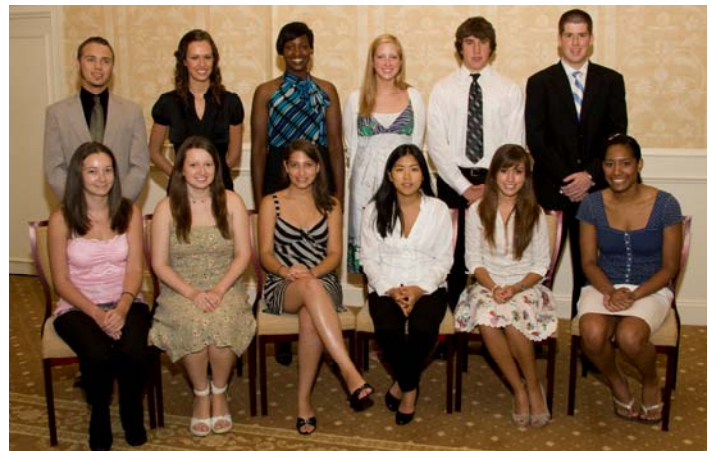
CSB Meyerhoff Scholars

to many Joseph and Harvey Meyerhoff Scholars in the future.”