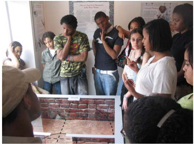
Passport participants at the Reginald F. Lewis museum

and implementing programs. We believe we should fund existing programs and services and/or intermediaries who connect to community wide services.