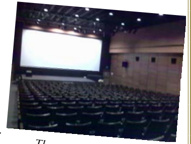
The new Meyerhoff Hall at Cinemateque