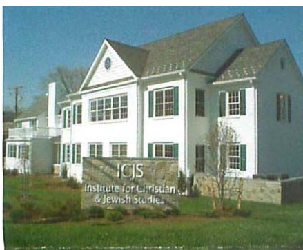
The new ICJS Bunting-Meyerhoff building

Renovations are complete and the Institute for Jewish and Christian Studies Bunting – Meyerhoff Center now has a home in Towson on Dulaney Valley Road. The new building houses a study center, offices