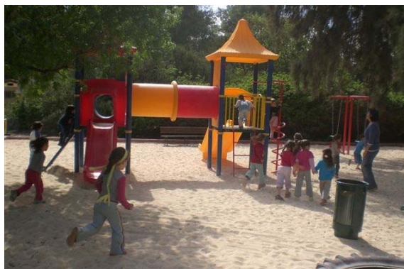
Children enjoying a newly installed Galila playground

ties much needed recreation facilities. The three new locations are: Kefar Yuval, Kibbutz Hanita and Kibbutz Metzuva. Previously, The Funds provided funding for three other playgrounds and the renovation of nine youth centers.